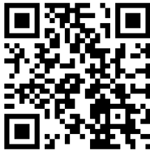
Scan this QR Code

Please visit the following DoAttend.com link to register for NLP track .